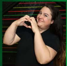
101 A.K.A V