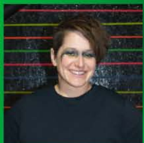
5 HURRICANE JANE