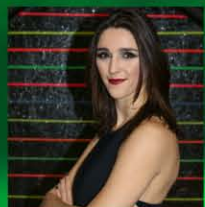
1997 ACHILLES WHEEL