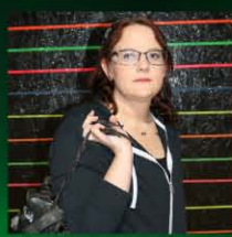
610 BASSET CASE