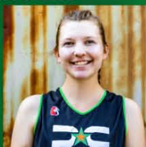
9 INDIGO NIGHTMARE