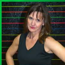
753 BAD MOM