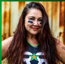
13 KIMBO SLICE