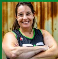
77 INDEPENDENT CLAWS