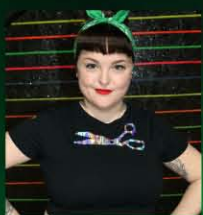
8 PIN PUSHION