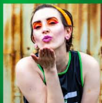
1959 GARBAGE BARBIE